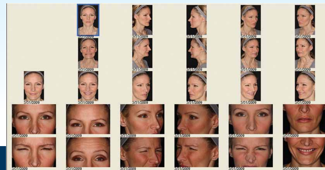
The Roberts Facial Rejuvenation Photography (RFRP) series comprises 28 facial views and 1 intra-oral view.